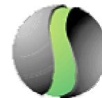
TABLE TENNIS Rules of the Game